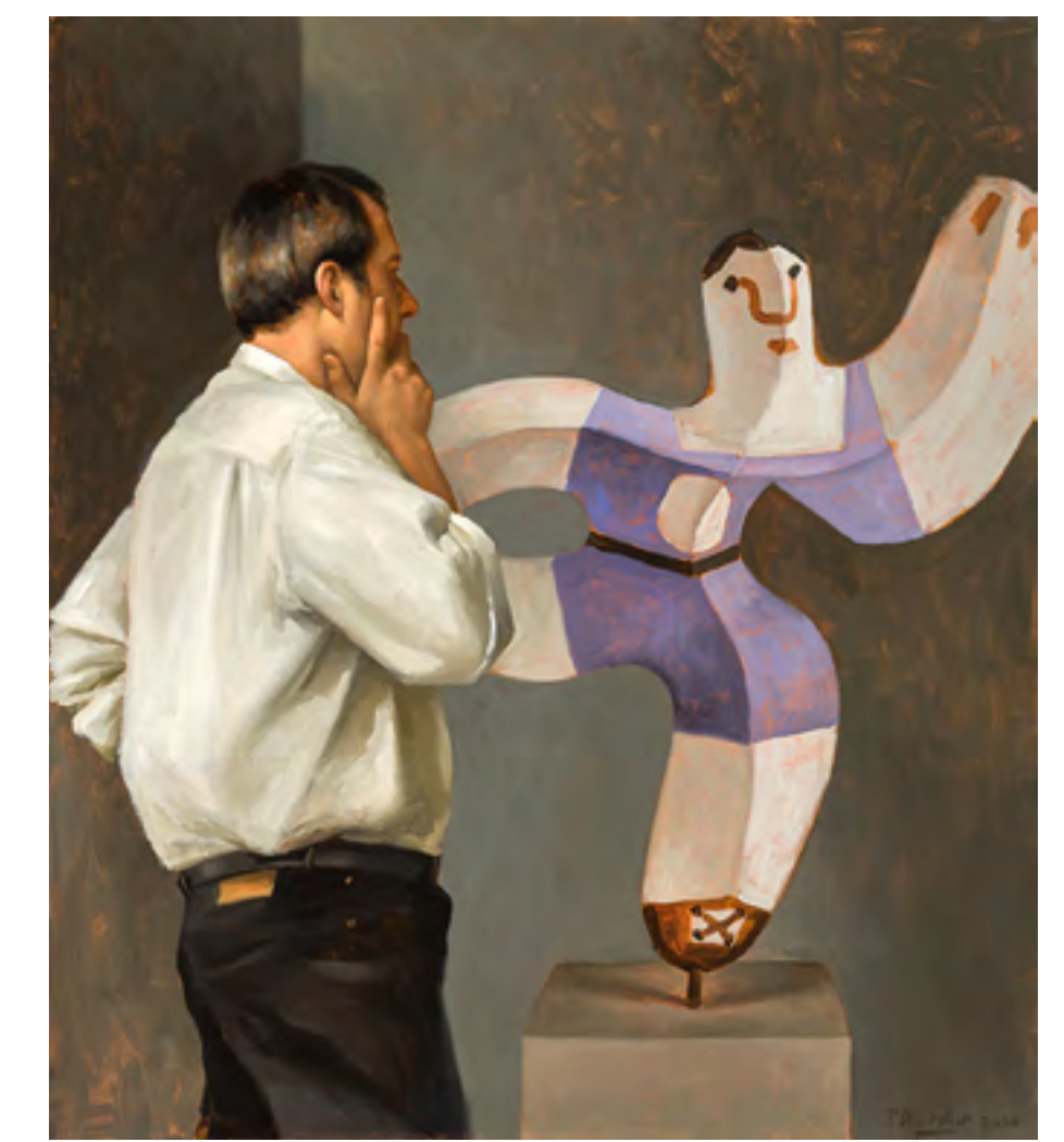
Regarding Picasso 2000 oil on canvas 122 x 107 cm