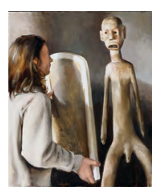
Reflection 2003 oil on canvas 92 x 76 cm

Laid Out 2001 oil on canvas 122 x 208 cm