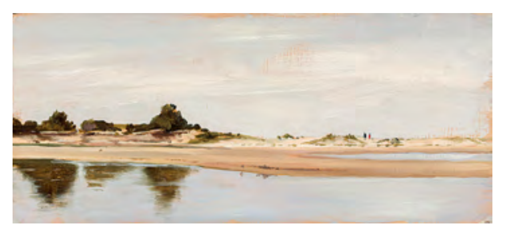
Low Tide Wonboyn 2004 oil on marine ply 20 x 45 cm