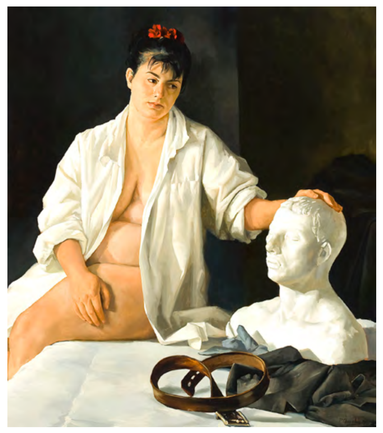
Dido and Aeneas 1999 oil on canvas 122 x 107 cm

recognising the joy in creating a painting which can be hung for others to appreciate, leading Churcher to his own easel.<sup>2</sup>