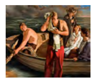
COVER The Outcast 1996 oil on canvas 168 x 198 cm

Drinking Age Verified 2004 oil on canvas 137 x 153 cm