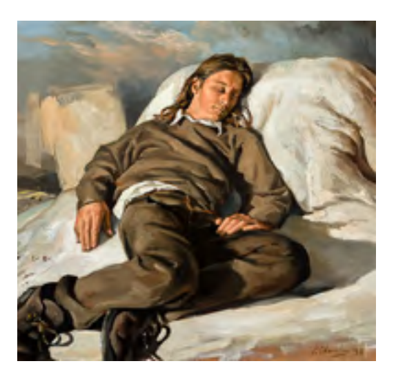
Ross's Dream 1998 oil on canvas 51 x 56 cm

Portrait of Kate 1992 oil on canvas 122.5 x 97 cm